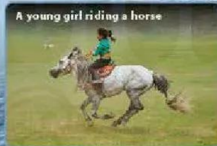
A young girl riding a horse