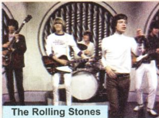
The Rolling Stones

Rock-'n'-roll, a type of popular music developed from jazz (rooted in the musical traditions of African-Americans) and country music (the southern / western folk music of rural United States), had not appeared until the 1950s. With hits like Heartbreak Hotel , Elvis Presley (1935–1977) was known as the “King of Rock-'n'-Roll.”