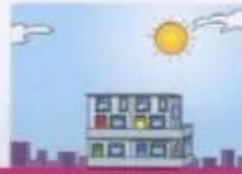
in the afternoon