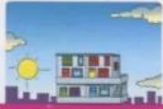
in the morning