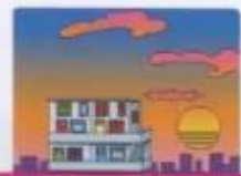
in the evening