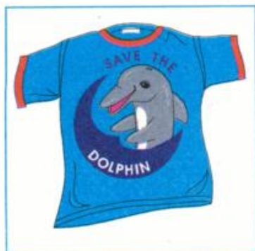
a) a colorful T-shirt