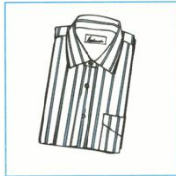
c) . . . . .