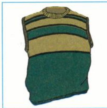
b) . . . . .